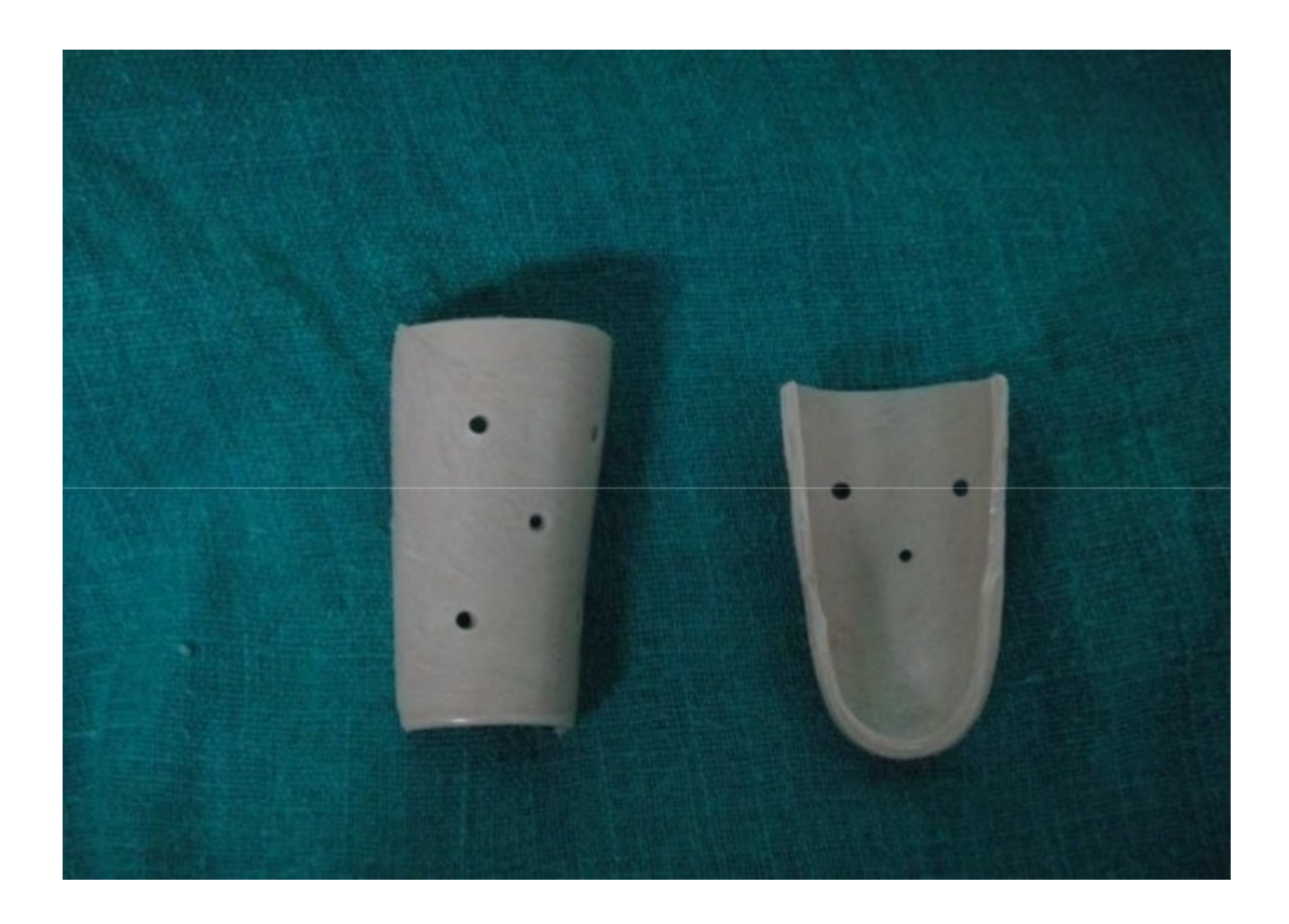
Figure showing cut Stax's splint