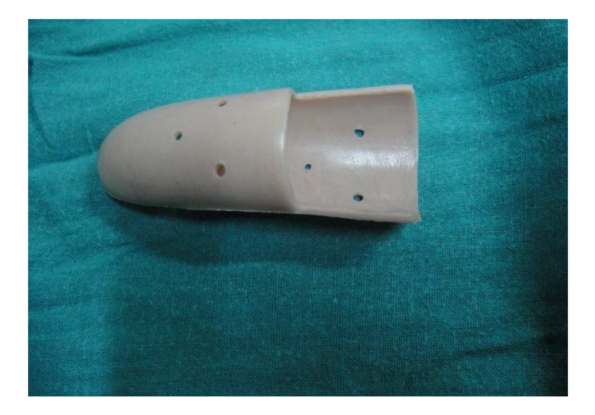
Figure showing STAX MALLET SPLINT

A Mallet splint <sup>2</sup> is a common tool used to treat Mallet (Trigger) finger. This splint is available in different sizes. It can be cut and introduced into the anterior nares. This keeps the nasal cavity open providing a good view of nasal septum area. It also has the advantage of leaving both the surgeon's hand free. The most proximal part of the Mallet splint is cut and shaped into a "U" shaped splint. This splint can be readily inserted into the nasal cavity. Since this splint is made of silastic, its memory holds the nasal cavity open.