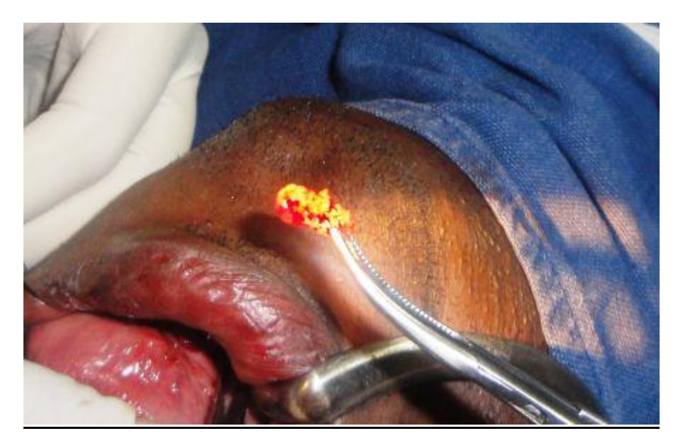
Fig 3: post-tonsillectomy specimen with tonsillolith in patient 1.