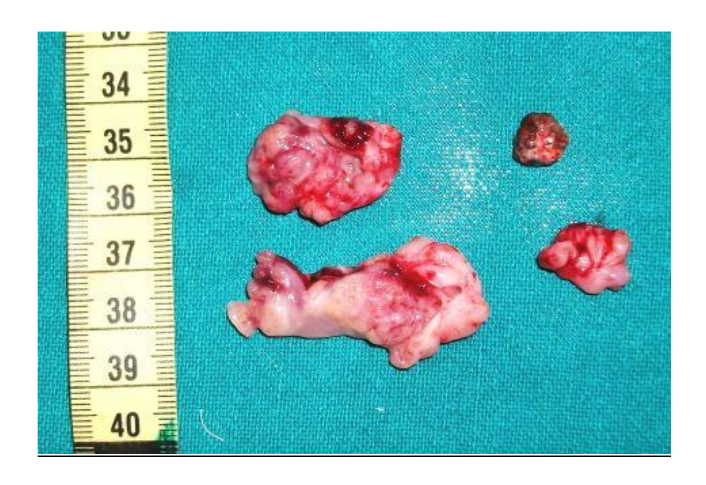
Fig 4 showing specimen of tonsil and tonsillolith after removal