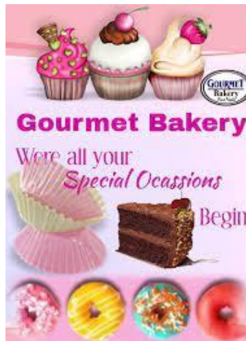
Figure 4 GOURMET BAKERY FLYER

Received: 30-Jan-2024, Manuscript No. JIACS-24-14435; Editor assigned: 01-Feb-2024, Pre QC No. JIACS-24-14435 (PQ); Reviewed: 16-Feb-2024, QC No. JIACS-24-14435; Revised: 25-Feb-2024, Manuscript No. JIACS-24-14435 (R); Published: 01-May-2024