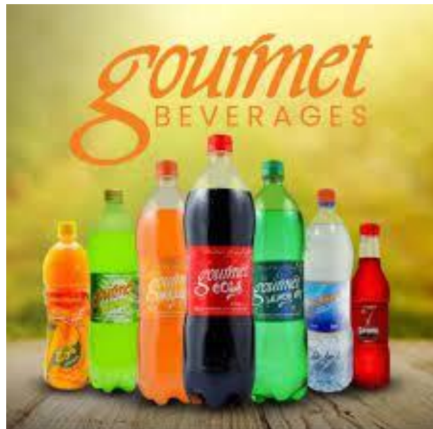
Figure 2 GOURMET BEVERAGES