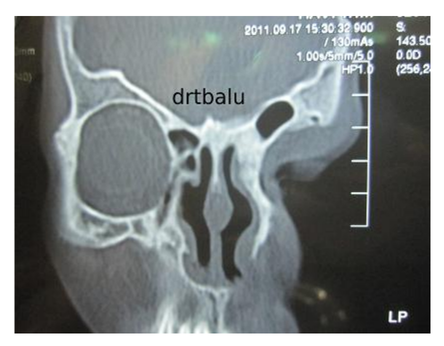
Coronal CT anterior cut showing hypoplastic frontal sinus