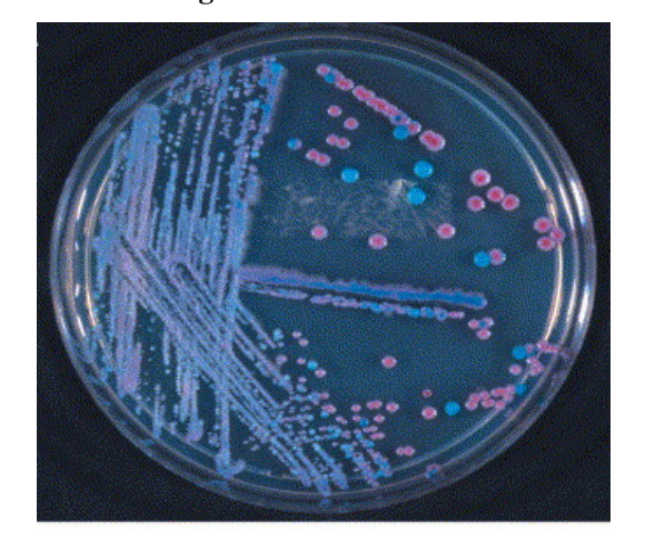
Figure 4. Candida glabrata (Pink)