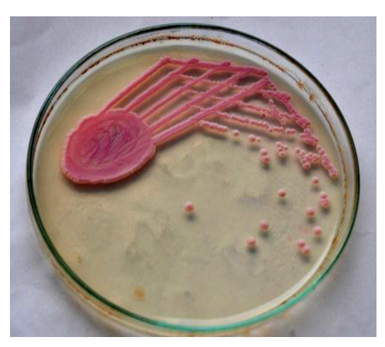
Figure 2. Candida krusei.