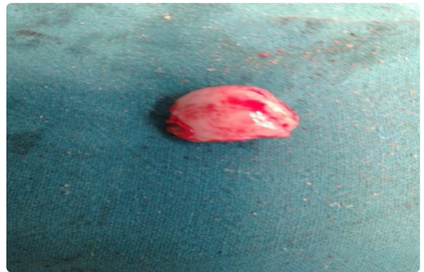
Figure 4: Showing specimen of osteoma after surgery.