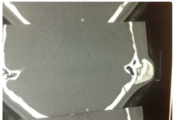
Figure 5: Showing axial cuts.