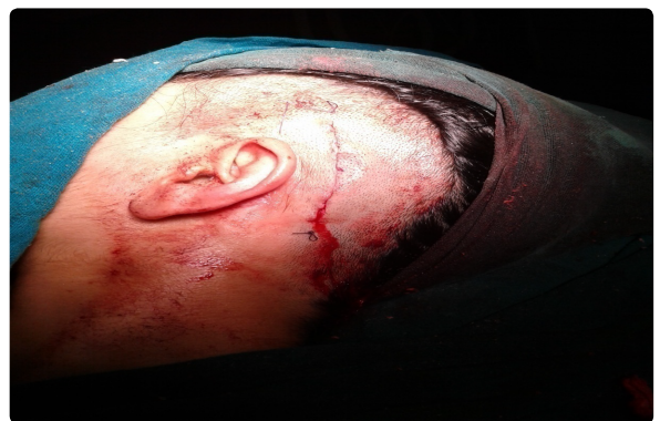
Figure 7: At time of completion of surgery.