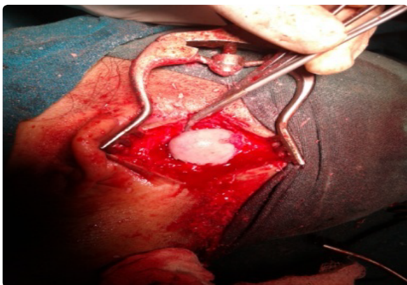
Figure 3: Showing intra operative findings.