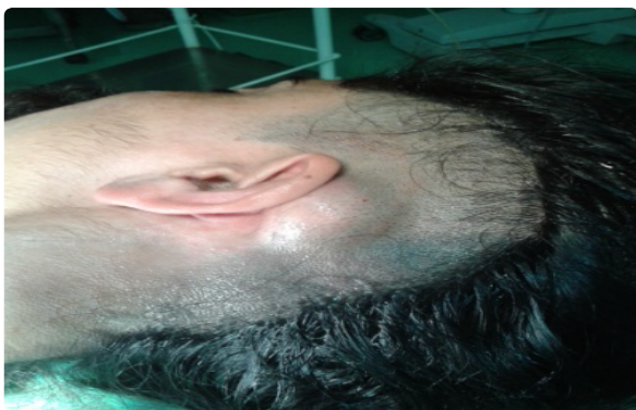
Figure 1: Showing preoperative post auricular mass.

A modified William wilde incision was given to provide complete exposure of osteoma. A groove