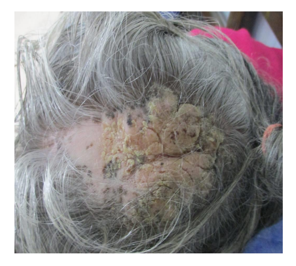
Figure 1 - vertucous plaque with cerebriform surface over scalp with a surrounding depigmentation with perifollicular pigmentation

To our knowledge, there are no reports of pemphigus vegetans presenting as CVG.