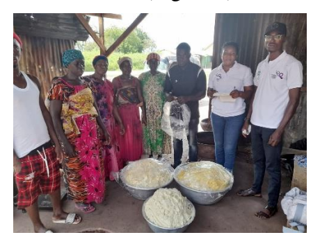
FIGURE 9 'INSPIRED LEGACY' TEAM RECEIVING THE SEA BUTTER PRODUCTION FROM THE COLLABORATING WOMEN CELLS

Many projects aim to secure funds to eliminate poverty for a specific region or specific group of targeted beneficiaries. Getting funds can be considered the easiest part of the story; the challenge is keeping the mediator focused on the socioeconomic development and not ending up with just another entrepreneurial project that utilises the community to make more profit. This might work for many, but there is no evidence so far that this double standard has managed to really bring people out of poverty, especially since poverty, as we all know is a complex problem that needs close monitoring by data and follow-up, which most business entrepreneurs would fail to do (Figure 9).