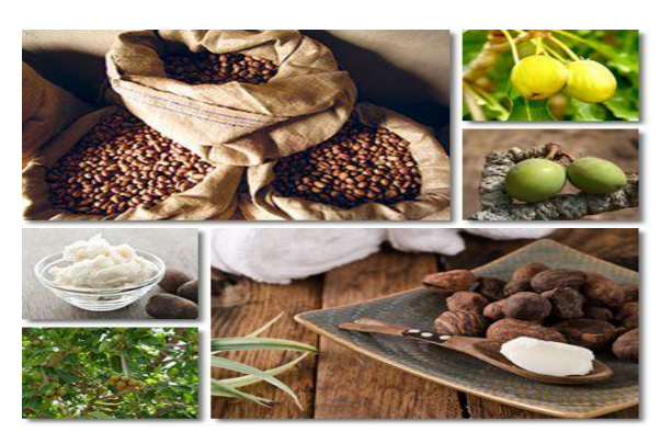
FIGURE 3 THE SHEA NUT SHAPES BEFORE BEING CRACKED, ROASTED, COOKED AND TURNED TO CREAM

Honfo et al., (2014) mentioned that the unique nutritional composition and chemical properties of shea products make them very competitive with any other plant. Therefore, there is a growing global demand for natural and organic beauty and cosmetic products. This demand has increased the value of shea butter in the African and international markets. In Africa and for African Americans, Shea butter is heavily used as people are more aware of its benefits for the hair and skin. Big companies that work on beauty and soap production, such as Unilever, are also considered one of the main clients for this product. This demand has opened up new opportunities for Ghanaian women to access the local market, further increasing their potential income (Hammond et al., 2019; Salawu & Ayanda, 2014; Elias & Carney, 2007).