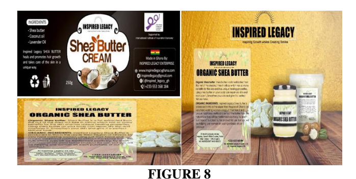
FINAL SHEA BUTTER PRODUCTION BY 'INSPIRED LEGACY'