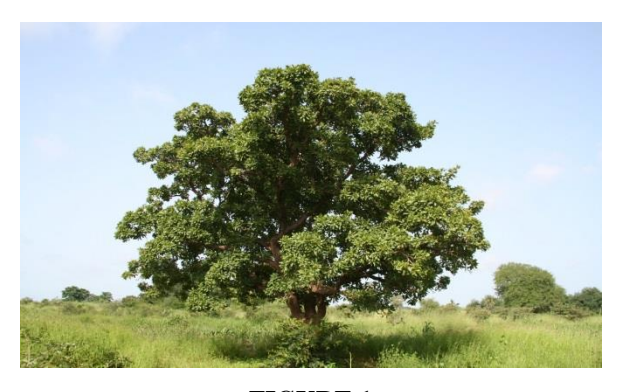
FIGURE 1 THE SHEA NUT TREE

Shea nuts include Shea nuts oil used for cooking, shea butter used in making soap, and cosmetics such as moisturisers, salves and lotions. It can also be used in the making of chocolate. Shea nuts are a substitute for cocoa in the north of Ghana. (Hatskevich et al., 2014)