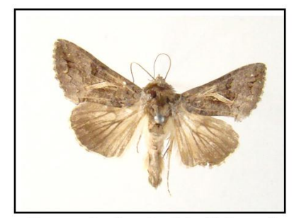
Ctenoplusia placida (Moore)