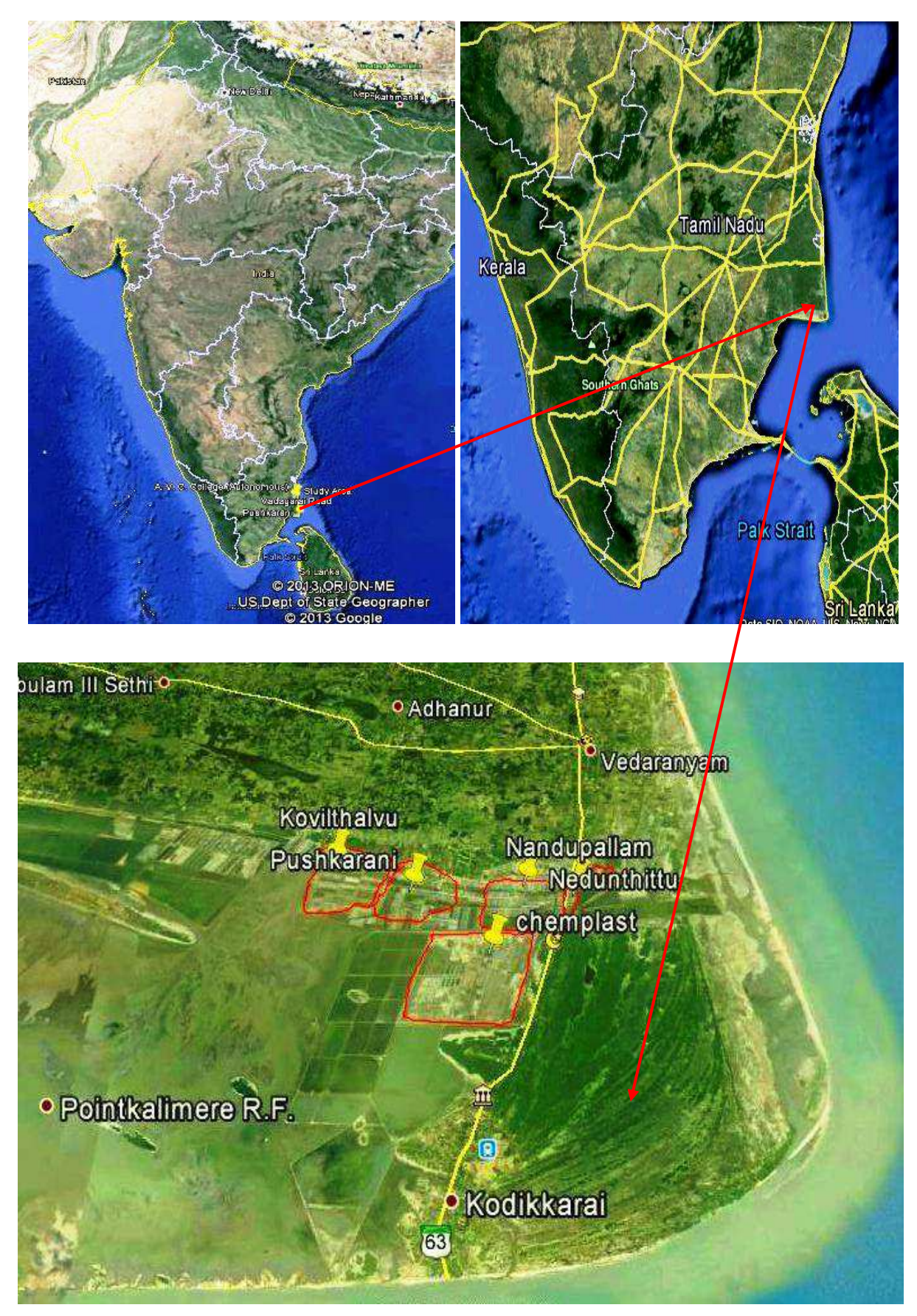
Figure 1. Map showing the saltpan areas of Kodikkarai, Tamilnadu.