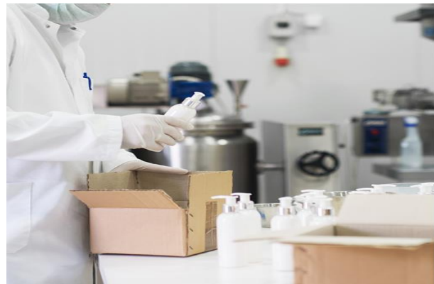
Figure 2 SECURE SEALING TECHNOLOGY